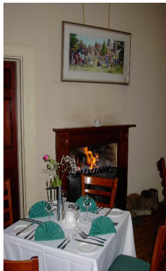
cosy dining in winter